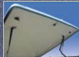
Slam Latch System with cantilever arms and pull-down closure strap