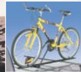
Optional bike rack