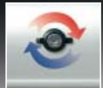
Standard: Twist Lock System® with slam latch and cantilever assist arms ensures easy operation.