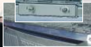
Dimension front hinge system