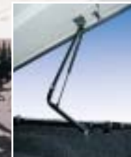
Lid opens and closes with ease using our new energy assist arms.