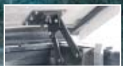
Rage and Hugger front hinge system