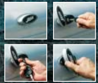
Jason ION® oval lock standard on Rage and Hugger