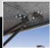
Lock release system