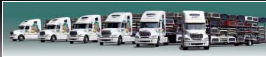
Our delivery trucks loaded & heading your way!