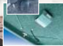
Optional lid lift system with carpeted interior and key FOB